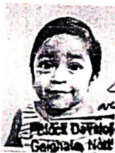
Block Development Officer Gaighata, North 24 Parganas

To the best of my knowledge he bears a good moral character. I wish him quick recovery in his life.